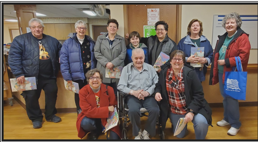
Sharing Christmas cheer to our homebound members.