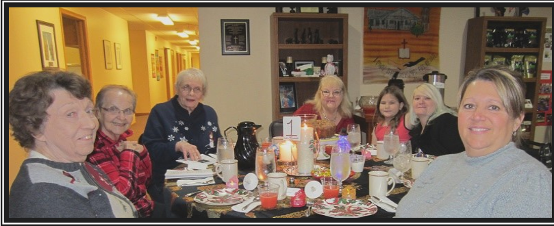
A wonderful night of fellowship, reflection and delicious desserts.